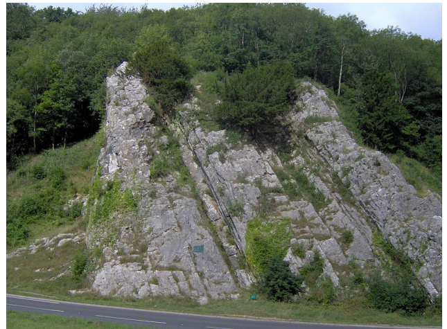
Rock of Ages, Burrington Combe, North Somerset, England