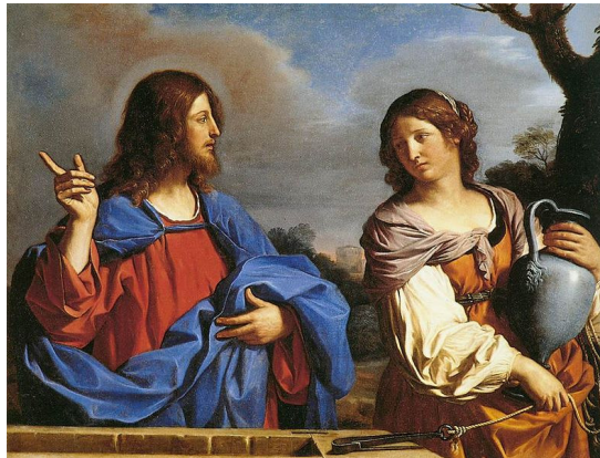
"Jesus and the Samaritan Woman at the Well" by Guercino

Many of the Samaritan people believed in Jesus because of the woman's testimony. When they came to Jesus, they asked Him to stay with them, so Jesus stayed there for two days. After they had heard Jesus, many more Samaritans believed because of His words. They told the woman, "We don't believe now because of what you said, but we have heard for ourselves, and we believe that this is the Savior of the world!"