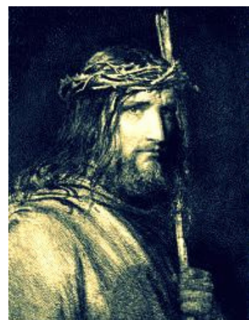
“Christ, Messiah” by Carl Bloch