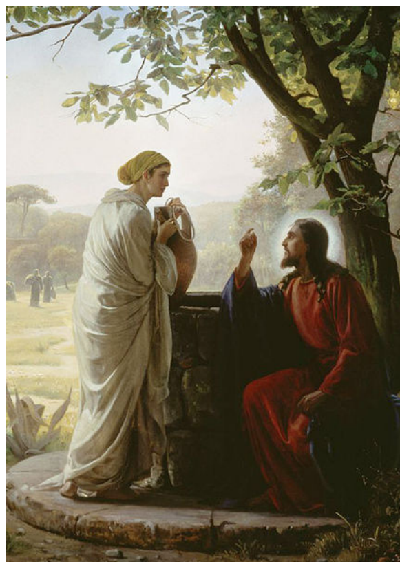
"Woman at the Well" by Carl Heinrich Bloch

If you have a bad reputation, or if you are living a sinful lifestyle, PLEASE talk to a Christian about it. God's grace and Jesus' blood covers every sin that you have committed. There is hope and there is new life in Jesus. The Gospel is for YOU. Believe it. The Living Water will wash you white and pure, and you will live at peace with God. He loves you, more than you can ever know. His heart is for you. His desire is for you. His blood is for you. Turn from sin and live.