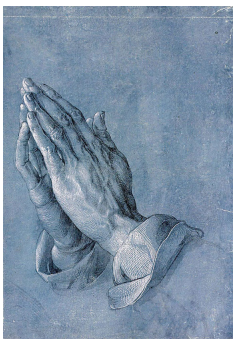
Praying Hands Albrecht Dürer