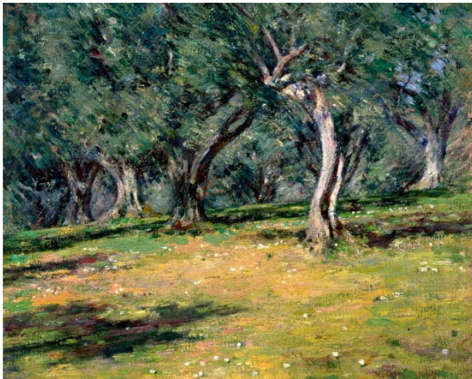
Olive Groves in Capri

Thy children (shall be) like olive plants round about thy table. Psalm 128:3