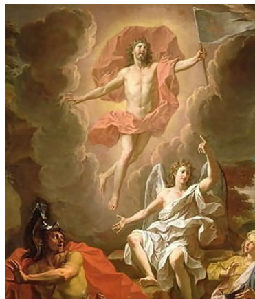
The Resurrection of Christ by Noel Coypel

We can only hold up the Perfect One to our family and friends, our coworkers and those we meet along life's journey.