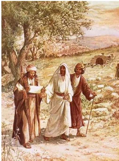
Jesus Appearing to Two Disciples on the Road to Emmaus

After spending this time with the disciples, Jesus led them out to a place called Bethany and He lifted up His hands and blessed the disciples. While He was blessing them, a cloud covered Him and He was carried up to heaven. He went back to His Father God.