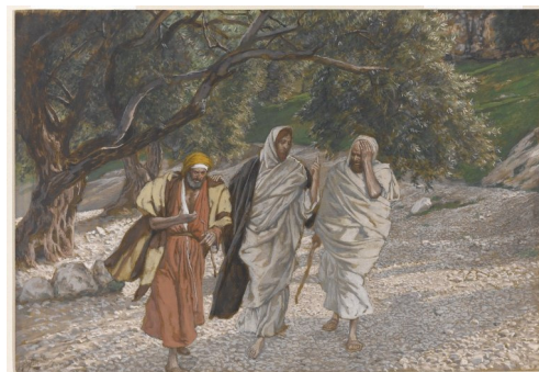
The Pilgrims of Emmaus on the Road By James Tissot

May this glorious message of the resurrected Lord have such a powerful impact upon us that we, too, will hasten to tell others this Good News! Everyone needs to know that Jesus, our crucified Savior, is living. He longs to dwell within us for it is in Him that we live, and move, and have our being (Acts 17:28). Or as the Apostle Paul wrote: For of him, and through him, and to him, are all things: to whom be glory for ever. Amen. (Romans 11:36) ~