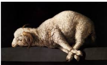
Agnus Dei (Lamb of God) by Francisco de Zurbarán

Worthy is the Lamb that was slain to receive power, and riches, and wisdom, and strength, and honour, and glory, and blessing. Revelation 5:12