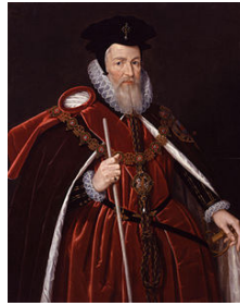
Lord High Treasurer William Cecil

H E THAT BEARS A COMMISSION from his king, that is, a peer, a privy counselor, or a minister of state, that is accounted a great man. Now, if being near the throne and conversant with the king makes a man great, clothes him with renown, procures him reverence and respect, loads him with popular applause, and encumbers him with splendor and pomp; with how much more divine and durable honor is the saint aggrandized, who, though alone from the world, dwells with God; and though not known among the busy crowd, resides about the throne! The high and lofty One who inhabits eternity gives His royal assent to their petitions, and will not say them nay; yea, The secret of the LORD is with them that fear him; and he will shew them his covenant. (Psalm 25:14) This is greatness indeed, to be in favor with Him who is a terror to kings.