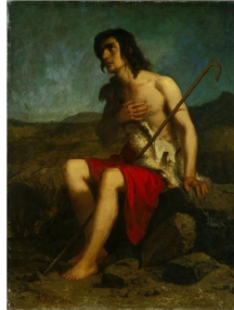
The Prodigal Son by Albert Anker

L AST SUNDAY EVENING I PREACHED FROM Luke 15 on the story of the prodigal son. I can relate to the prodigal son in the story. I was brought to Sunday School as a young boy and heard the Word of God, but in later years I rebelled and thought it would be more fun and fulfilling to live according to my sinful desires. In the story of the prodigal son, the young man had hit bottom and his friends had left him before "he came to himself" and said, I will arise and go to my father, and will say unto him, Father, I have sinned against heaven, and before thee, And am no more worthy to be called thy son: make me as one of thy hired servants. (Luke 15:18-19)