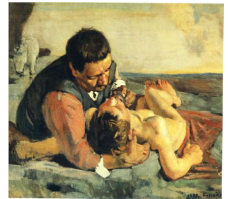
The Good Samaritan by Ferdinand Hodler

N ow thou art great (for the saints, since they live near God, are the greatest men in the world) and perhaps knowest it not; but, let thy greatness kindle thy gratitude, not increase thy pride. To keep the saints humble, divers afflictions are allotted them in this life; as a royal father, fearing lest his son, the young prince, under his present grandeur and prospect of the crown, may swell beyond himself, deals so hardly with him that oft he fears the king intends to disinherit him; yet so many bright displays of paternal affection assure him it shall not be so; and the truth is, it is out of love, that he may not mount the throne with unsubdued passions or sway the scepter in thoughtless folly. So it fares with the saints, who should know, in the celestial promotion, that it comes neither from the east, nor from the west, not from works of righteousness which we have done, but it is God alone that exalteth. My life, then, is a paradox; I am mean, but great; miserable, yet happy; poor, but possessing all things; a beggar, and a prince; but eternity shall unriddle it, taking away the one part and illustrating the other. ~