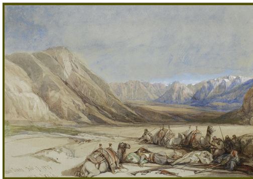
Mount Horeb, also called Mount Sinai

Later on Mount Moriah Solomon built a temple. —2 Chronicles 3:1