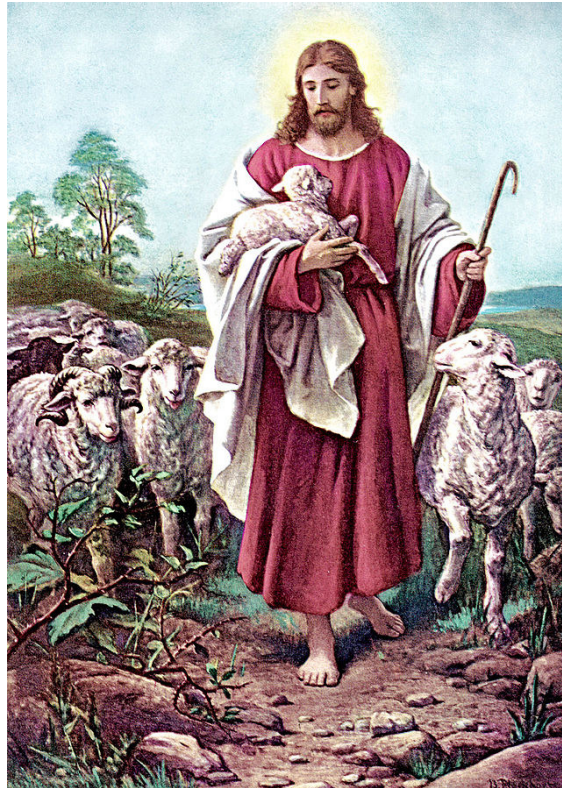
Good Shepherd Bernhard Plockhorst

Sheep without a shepherd—or sheep with a lazy, not so good shepherd—will have many problems and will die. We, like sheep, NEED a shepherd, and our Shepherd is Jesus.