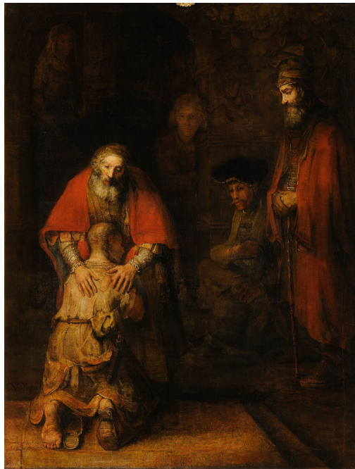
The Return of the Prodigal Son Rembrandt

Luke 15: 20 And he arose, and came to his father. But when he was yet a great way off, his father saw him, and had compassion, and ran, and fell on his neck, and kissed him.