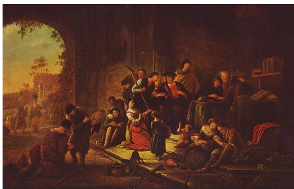
Jacob de Wet —17th Century

wishes. He was perfectly fair to the laborers who worked for the entire day, for they agreed to work for a penny a day. Those laborers were offended because the householder was equally gracious to all those who were invited to labor in his vineyard, regardless of how long they had worked.