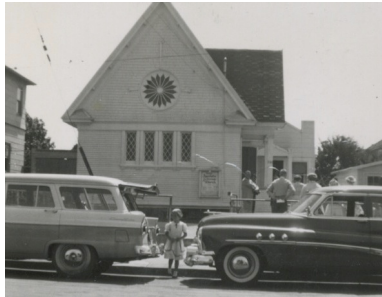
Channing Way Church