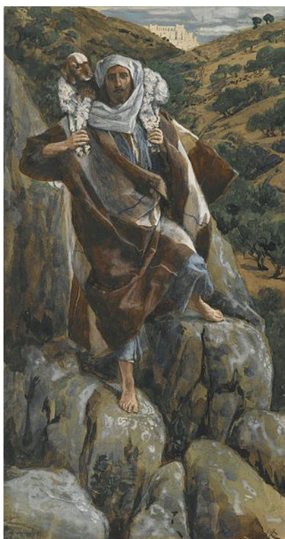
The Good Shepherd James Tissot

Him, but Christ alone, our Shepherd, must do everything. ~