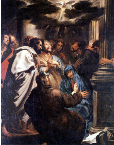
Pouring of the Holy Ghost Anthony van Dyck

I imagine this to have been an amazing thing to experience. Just think a moment about this. This had never happened before. The disciples were going to learn what Jesus had meant when He said, "I send the promise of the Father upon you ; but stay in the city of Jerusalem, until you are given power from on high (St Luke 24:49)."