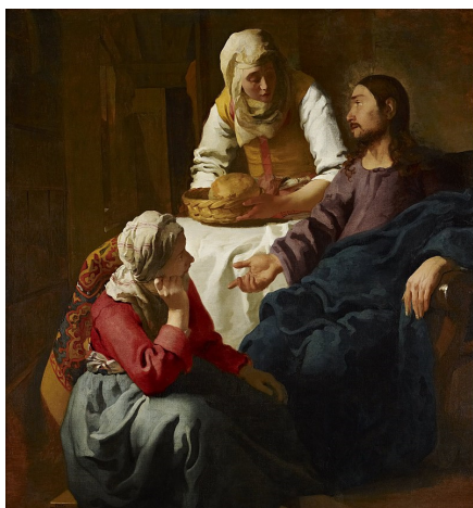
Christ in the House of Martha and Mary Johannes Vermeer

In conclusion, therefore, may I repeat the exhortation of the writer to the Hebrews: Wherefore seeing we also are compassed about with so great a cloud of witnesses, let us lay aside every weight, and the sin which doth so easily beset us, and let us run with patience the race that is set before us, Looking unto Jesus the author and finisher of our faith; who for the joy that was set before him endured the cross, despising the shame, and is set down at the right hand of the throne of God. (Hebrews 12:1-2) Amen!