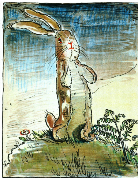
The Velveteen Rabbit, Margery Williams