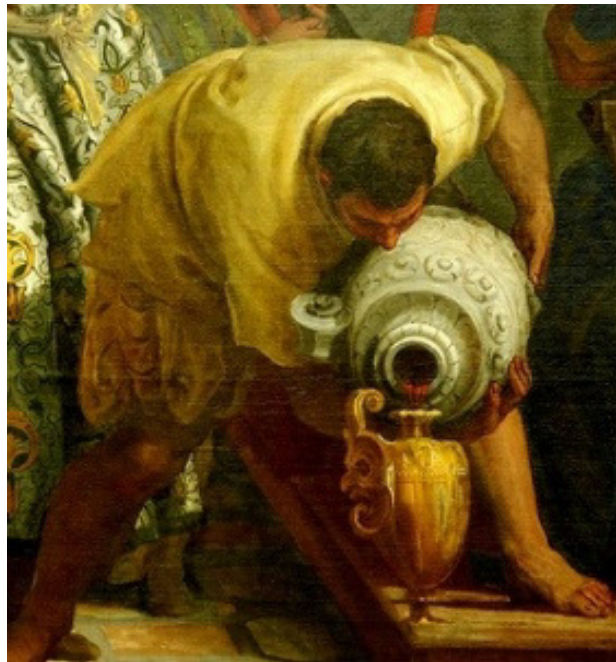
Detail of servant with water jar from The Wedding at Cana Paolo Veronese

way Christ, our Lord, still continues to change water into wine in my house and in thine, if we are but faithful and pious. By His blessing He causes one loaf of bread to supply the place of ten, and one coat to wear longer than otherwise three. If we would but open our eyes, our experience would compel us to exclaim: Lord, in Thee do we trust in the performance of our domestic labors; they also are of Thy institution; Thou didst honor and bless them and still continuest to bless them. Therefore will I cherish my calling and be industrious in it. ~