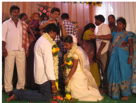
Wedding Ceremony in India

Parents of the bride and groom will be called forward and the bride's father will be asked to take the right hand of the bride to put into the right hand of the groom.