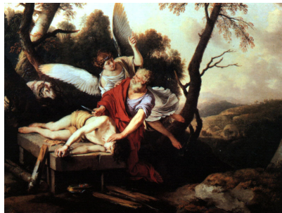
Abraham by Laurent de La Hyre

God provided a ram for the offering. Abraham offered up the lamb as a burnt offering, instead of his son.