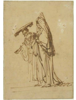
Ruth and Naomi by Rembrandt

Naomi encouraged her daughters-in-law to go back to their own people and live, but Ruth refused to go. She said that she would leave her people to go with her mother-in-law and live with her people. In chapters 2-4, she went with Naomi, and when they came to the land of Naomi's people, God provided a husband for Ruth. His name was Boaz. When they had a son, he became Naomi's joy, and she was the child's grandmother and babysitter. God provided and joy returned.