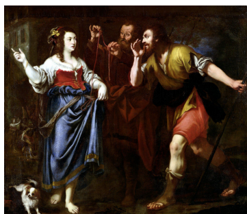
Rahab and the Emissaries of Joshua

Joshua: A harlot named Rahab hid some spies at her home when they were spying out the city of Jericho. She did not want the guards to catch these men, as she told the spies she knew that the Lord had given them this land. She feared the Lord and she asked the men if, for her kindness in hiding them, they would save her and her entire family from death when the city was destroyed. They promised her this, and when the walls of Jericho fell, she was saved