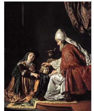
Hannah Giving Her Son Samuel to the Priest by Jan Victors

1 Samuel: A woman named Hannah was married to a man named Elkanah. She was so sad because she had no child to love, and she was made fun of by other women who had children. Hannah went to the temple to pray and ask God to give her a son, and if He would, she would give him to the Lord for His service all the days of his life. God saw her sadness and heard her prayer, and also her promise to Him. He answered her prayer and gave Hannah and Elkanah a son whom they named Samuel. How their hearts were full of joy! When Samuel was still young, he went with his parents to the temple of the Lord far from their home. They left him there to work for God. God provided a son for Hannah, and she kept her promise and gave him to the Lord's work. No doubt Hannah's heart was heavy as she walked home, but in her heart she also had joy because God had provided for her. He allowed her to have 3 more sons and 2 daughters.