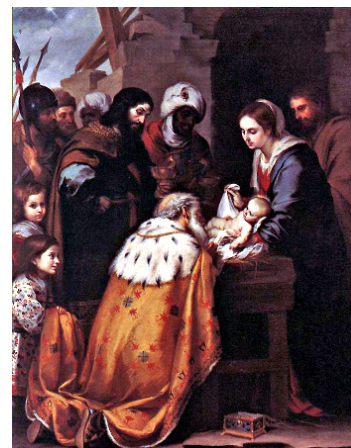
Wise Men Adoration by Bartolomé Esteban Murillo

May the Epiphany, the manifestation of God, bring His peace to our hearts this new year. ~