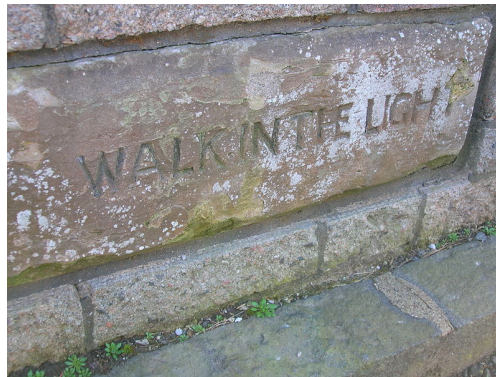
Walk in the Light

John continues, And these things write we unto you, that your joy may be full. This then is the message which we have heard of him, and declare unto you, that God is light, and in him is no darkness at all. If we say that we have fellowship with him, and walk in darkness, we lie, and do not the truth: But if we walk in the light, as he is in the light, we have fellowship one with another, and the blood of Jesus Christ his Son cleanseth us from all sin. If we say that we have no sin, we deceive ourselves, and the truth is not in us. If we confess our sins, he is faithful and just to forgive us our sins, and to cleanse us from all unrighteousness. If we say that we have not sinned, we make him a liar, and his word is not in us. (1 John 1:4-10) ~