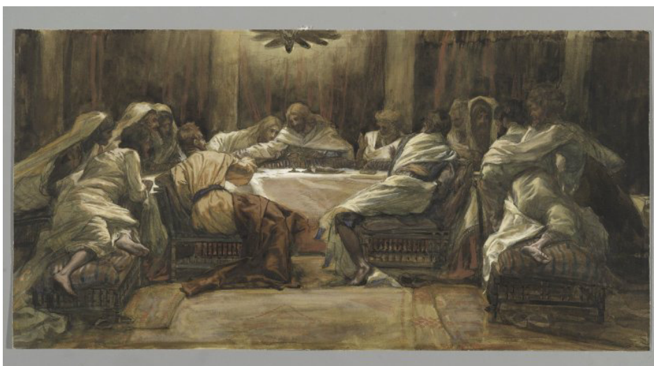
The Last Supper James Tissot

Faith/hope is the chain that binds you to Christ who has entered in within the veil of heaven. Do you find yourself burning up with some temptation? "Hold fast" that "hope"! Hold fast to the end though you seem to fall more than you rise and walk! Hold fast the hope that Jesus has paid it all, endured it all and does not stop calling you back to His flock, to His broken body, "broken for you" and to His shed blood, "shed for you for the remission of sins". And even if it seems Satan himself is dragging you backward into the pit of hell, as your fingers slip the last half inch over the edge "Hold fast" and hope to the end for the grace that is to be brought unto you at the revelation of Jesus Christ. (1 Peter 1:13) Though the fiery temptation scorches