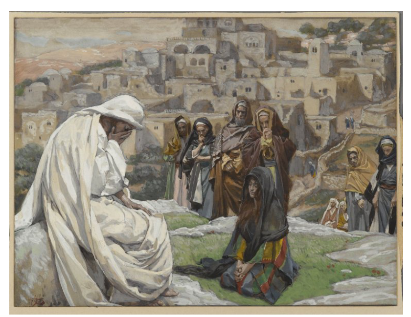
Jesus Wept, by James Tissot