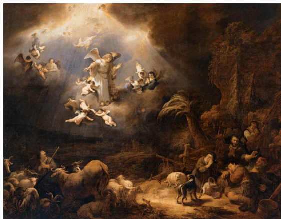
Angels Announcing the Birth of Christ to the Shepherds Govert Flinck

They tell everyone they meet along the way about what they have seen and heard. It is all too wonderful to keep to themselves. Everyone who hears them tell it, wonders at those things. But Mary kept all these things, and pondered them in her heart. (v. 19)