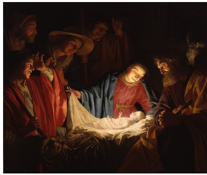
Adoration of the Shepherds Gerard van Honthorst

Oh, no! He is a living and present God. We know Him as revealed in the flesh. Because no man knows the Father except the Son (Matthew 11:27). But can I then believe that God has become revealed in the flesh? It is too great and