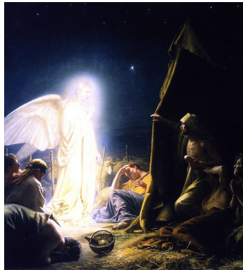
The Shepherds and the Angel Carl Bloch

The same angel then appeared to Mary and spoke to her of her part in God's plan of salvation. Luke 1:30: And the angel