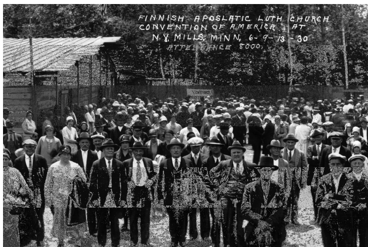
Text on photo: "Finnish Apostolic Luth Church Convention of America at N. Y. Mills, Minn, 6-9-13-30 Attendance 8000"

LOOKING AHEAD: The 2016 Annual Convention will be hosted by the Eastside Apostolic Lutheran Church of Greer, South Carolina. Devotional services will be held in the morning, afternoon, and evening, beginning on Thursday, June 23 rd through Sunday June 26 th at the Spartanburg Expo & Event Center. Ministers, members, and the general public are invited to participate in these services. Information regarding our service schedule and lodging information will be posted on the www.apostoliclutheran.org website, as well as our Facebook page ALC Convention 2016.