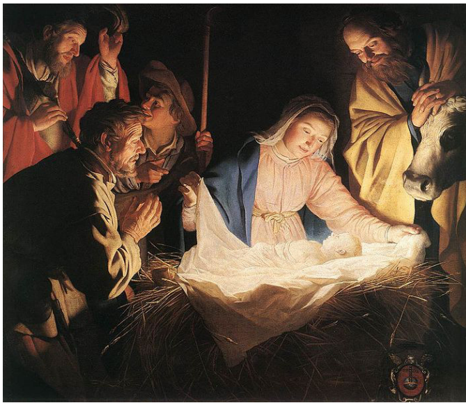
Adoration of the Shepherds, Gerard van Honthorst

I F CHRIST HAD ARRIVED WITH TRUMPETS and lain in a cradle of gold, His birth would have been a splendid affair. But it would not be a comfort to me. He was rather to lie in the lap of a poor maiden and be thought of little significance in the eyes of the world. Now I can come to Him. Now He reveals Himself to the miserable in order not to give any impression that He arrives with great power, splendor, wisdom, and aristocratic manners. But upon His return on that Day, when He will oppose the high and the mighty, it will be different. Now He comes to the poor, who need a Savior, but then He will come as a Judge against those who are persecuting Him now.