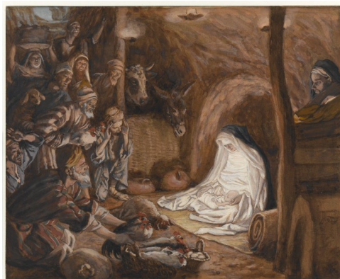
The Adoration of the Shepherds, James Tissot

retained. In like manner St. Luke speaks in the text of Mary, that she kept all these sayings, pondering them in her heart. Without doubt she did not let the humble appearance of the shepherds trouble her, but esteemed all as the Word of God. Not only Mary, but all the others who heard these words from the shepherds, and wondered, as the text says. All clung to the Word. ~