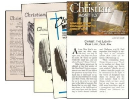
Christian Monthly Covers from the Past

Have a blessed day and keep on learning about God and Jesus. Choose that good part which is Jesus and you will be blessed. ~