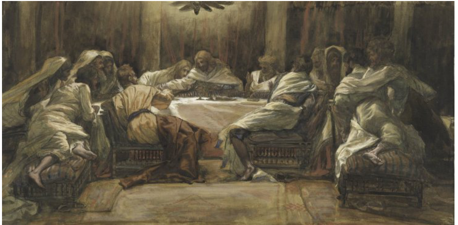
The Last Supper: Judas Dips His Hand in the Dish James Tissot

God's creation is very beautiful and it makes us happy, but the thing that should make us the happiest is that God gave us His Son Jesus. If it were not for Jesus we would not have true happiness and peace.