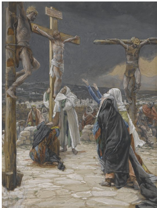
The Death of Jesus James Tissot

There was nothing Pilate could do, so Jesus was led away to the place of crucifixion, namely Calvary. There He was crucified with two criminals. One said mean things about Jesus and the other rebuked Him and said, "We deserve our punishment, but this man has done nothing wrong." He asked Jesus to remember him when He went to His kingdom. Jesus told him, "Today you will be with Me in Paradise." That is so beautiful. Did Jesus stay dead on the cross? No, because there is no life there. He came back to life, a new life. He was victorious over the grave, over death. The grave had no power to keep Him. What a wonderful thing Jesus did for us by dying and shedding His blood as a payment for our sins, but more special than that He arose from the dead so we can be victorious too, and have life in Him.