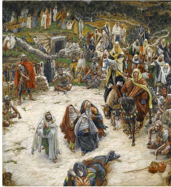
What Our Lord Saw from the Cross James Tissot

Do you believe what the whole of Scriptures testify, that only because of Christ having fulfilled the Law, yes, only because of the righteousness of Christ we will become righteous? Then the only question remaining to check your assurance will be: "Can I be certain that Christ has fulfilled the Law to the full satisfaction of the eternal Father?" You can certainly rest assured. Christ has fully kept the Law. He loved the Father with all His heart, and with all His soul, and with all His power, and with all His mind. It was His meat to do the will of His Father. Equally completely He has also loved His neighbor as Himself, so much so, that He even forgot Himself and poured out His soul unto death, was numbered with the transgressors; and bare the sin of many, and made intercession for the transgressors (Isaiah 53:12). He became obedient unto death, even the death of the cross (Philippians 2:8). Because He was made under the Law, it also meant that He was able to take on Himself the judgment and