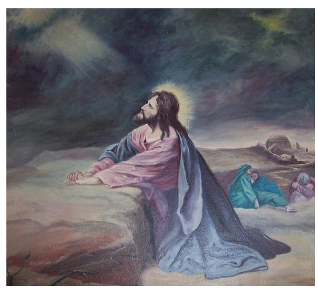
Christ in Gethsemane

You can find the whole story in Luke chapters 22-24.