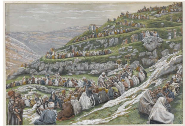
"The Miracle of the Loaves and Fishes" by James Tissot

watered garden, and like a spring of water, whose waters fail not. (Isaiah 58:11) He that believeth on me, as the scripture hath said, out of his belly (heart, innermost being) shall flow rivers of living water. (John 7:38) I might add a little comment here: For years I understood this only from the standpoint that as long as we believed according to the Bible (we were scripturally correct in our doctrine) we would be a blessing to others. But it has opened up to have a richer meaning, for now it seems that it means more in this sense that the Scripture has said that when we believe on Him, out of our heart will flow the blessing of life to others. The first understanding is certainly necessary and correct, but to me the further revelation opened up to me more joy in my heart and soul at the understanding that we are more like a conduit pipe than a reservoir within ourselves, which is what Isaiah wrote when he described the life concerning how blessing received causes us to be a blessing to others.