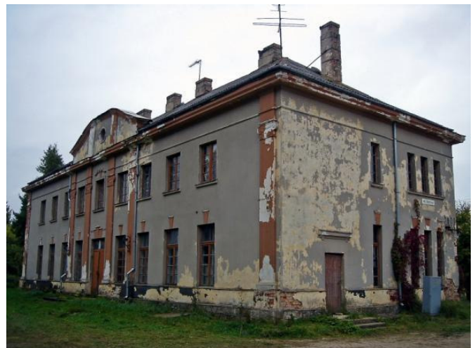
Blidene Railway Station

In July 1944, the German forces were retreating from the Russian forces and the warfront was nearing our home. I and my wife, who was with child, determined to abandon our living in the provincial city of Kraslava, where I worked as a judge, and go to my father's home which was about 200 miles further from the nearing warfront. To determine to do this was one thing, but to realize our goal was quite another, since the German military forces had extremely limited the traffic of civilians. We would only be able to buy railway tickets with the permission of the German Ortskommandantur (District Commander), and this was only in case of an extreme necessity. As to our belongings, we could only take what I could carry in two bags.