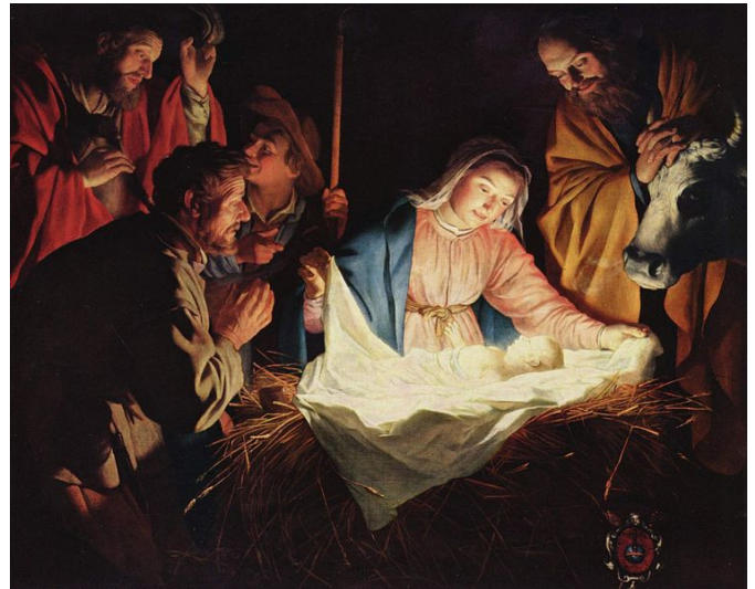
Adoration of the Shepherds by Gerard van Honthorst (1592-1656)

Then the sky was filled with angels praising God and saying, Glory to God in the highest, and on earth peace, good will toward men.